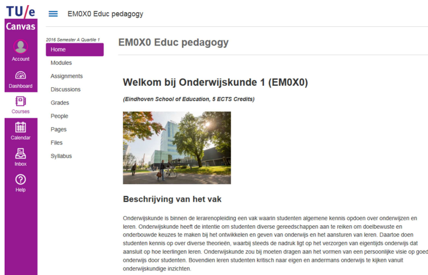
Figure 3: Screenshot of Canvas

The second session of the virtual internship ran in learning management system Canvas (Figure 3). This webapplication is the new LMS in use at Eindhoven University of Technology.