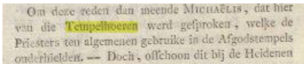
Figure 2: Delpher image snippet showing the correct search result ‘Tempelhoeren’ (i.e. Temple whores) for the query term ‘Tempelhoeren’ highlighted in yellow. ( http://resolver.kb.nl/resolve?urn=dpo:10706:mpeg21:0106 )

Add to this that in Dutch compounds are written as single words and another layer of complexity unfolds. We find ‘tempelhoeren’ 4 times in EDBO. Consultation of the originals in Delpher shows that twice the printed word is in fact ‘temple whores’ (cf. Figure 2), but even so twice ‘temple lords’ should have been recognized (cf. Figure 3). The converse may be true for any number of the 126 occurrences of ‘Tempelheeren’ (disregarding capitalisation).