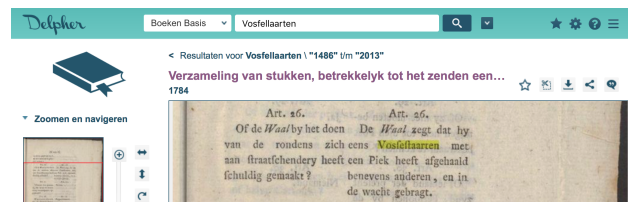
Figure 1: Image snippet from Delpher showing the query term and the search result highlighted in yellow on the page image ( http://resolver.kb.nl/resolve?urn=dpo:7291:mpeg21:0453 )

frequent characters used in Dutch. Words displaying this phenomenon are therefore still too often left uncorrected by our system as the f-s confusion coupled to another two other misrecognized characters are prevented from being corrected due to the LD limit set at 2.