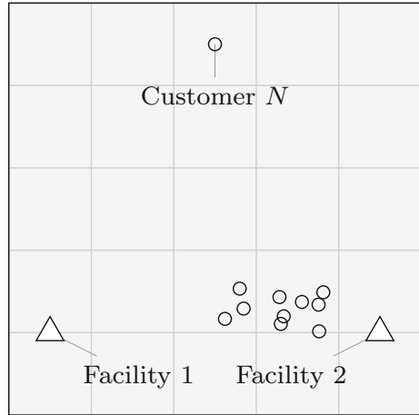
Fig. 2 Facility location problem with the most remote customer N at the same distance from both facilities. The two facilities are depicted by triangles , the customers by circles

where d_i denotes the uncertain demand of customer i . The facility location problem consists of two types of decisions, namely the decision to open facility 1 ( x_1 = 1 ) or facility 2 ( x_2 = 1 ) and the actual deliveries to the customers from the opened facility. Only one of the facilities may be opened. The total delivery to customer i from facility 1, respectively facility 2, is y_{1i} and y_{2i} and has unit costs c_{1i} and c_{2i} . The goal is to minimize the worst-case transportation costs, which is modeled as: