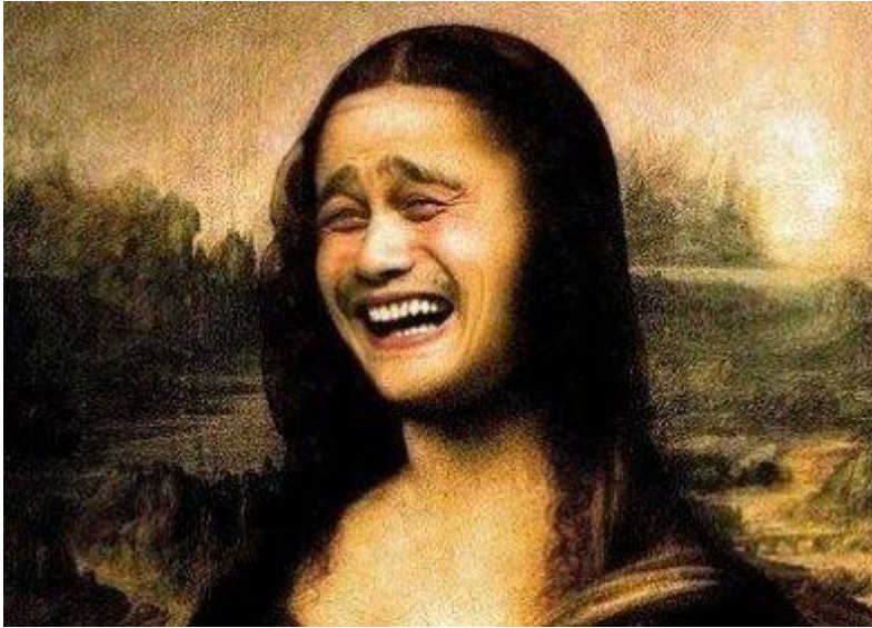
Figure 3: Mona Lisa “Bitch please”.