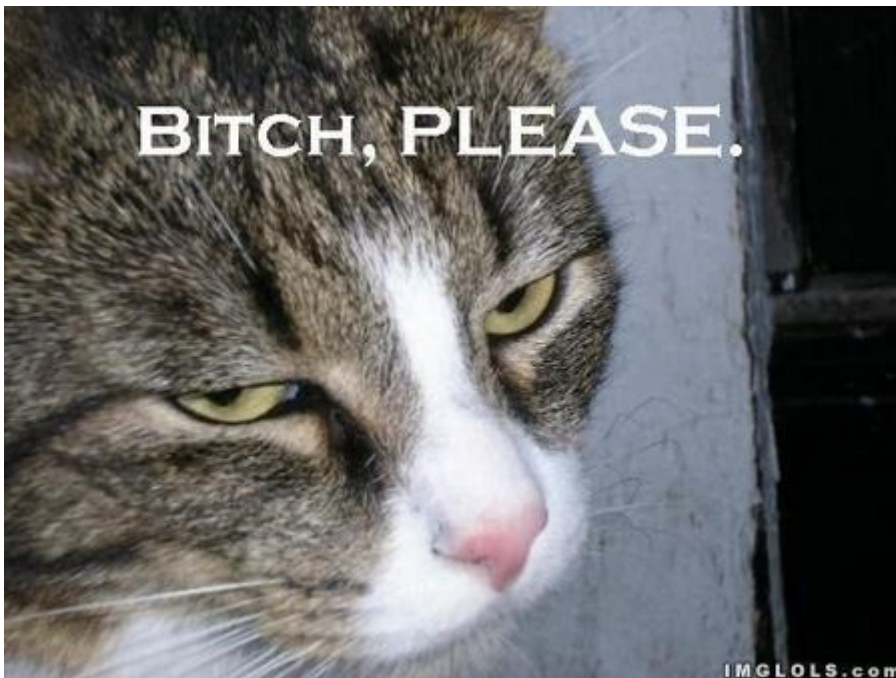
Figure 4: Lolcat “Bitch Please”.

What my teenage interlocutors agreed upon was that the use of such memes is “cool”. Memes are used – that is: they are sent around, “liked”, “retweeted” and “shared” at high speed and in large numbers – because the use of memes is “cool”, and people who use them are “cool” as well. “Cool” appears here to have a double semiotic effect: a pragmatic-metapragmatic effect as well as an identity effect. I shall return to this point later. Here we notice that “cool” communication is the function of memes – or at least, one of the higher-order functions, possibly allowing more specific ones, such as the ones described by my interlocutors for “Bitch Please”.