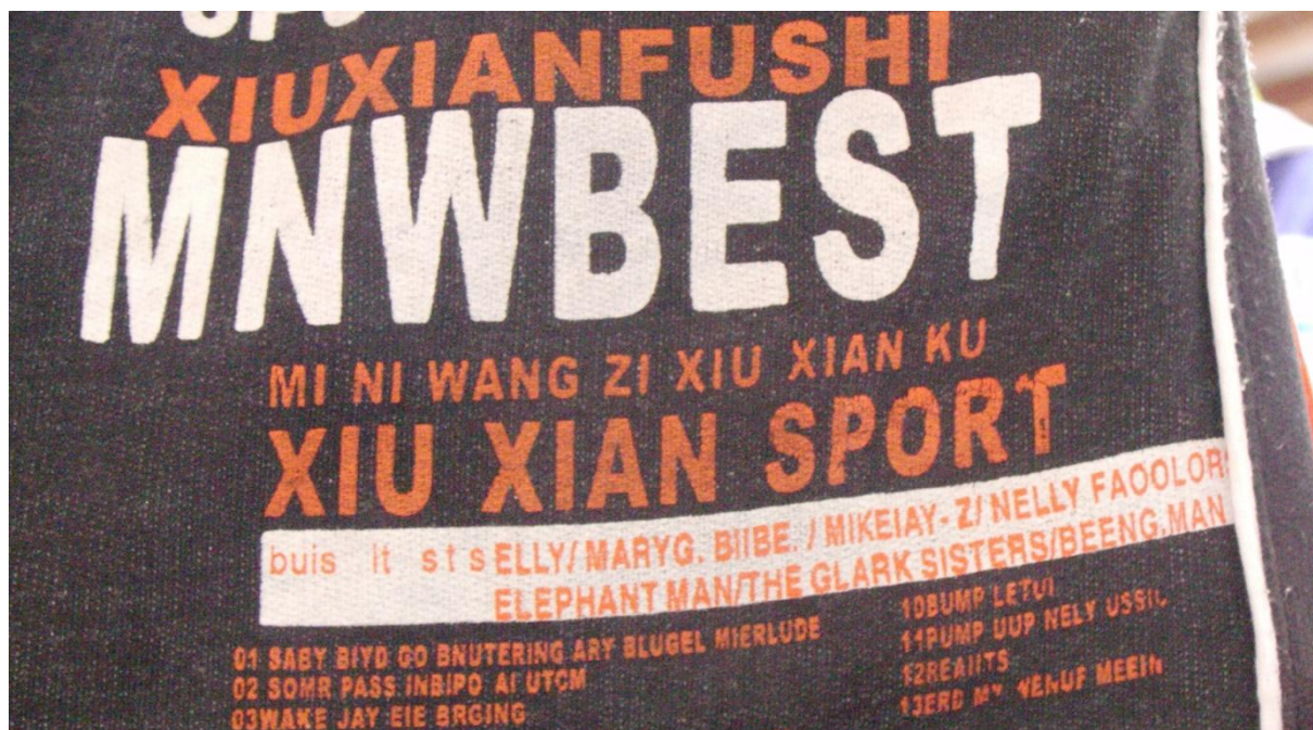
Figure 1: Lookalike English (Lijiang, China, August 2011).

accurate parsing, we now know that natural languages can have a great deal more functions, many of which appear to bear little denotational weight.