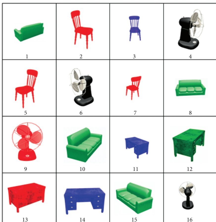
Figure 4. Picture card of one of the furniture grids as presented to the matcher.

The director had a laptop screen to his or her side and the matcher had a picture card in front of him or her. The director and matcher could see each other directly, but could not see each other's screen or card. The participants were given written instructions and had the opportunity to ask questions to the experimenter, after which the experiment started. The director was then presented with a trial on the computer screen (as in Figures 1 and 2). The director was asked to provide a description of the target object in such a way that the matcher could distinguish it from the 15 distractor objects. The matcher had a picture card filled with 16 numbered objects (see Figure 4 for an example) in front of him or her, which was not visible to the director. The matcher's card showed the same objects as on the director's screen, but these objects were ordered differently for the director and the matcher and only the matcher's objects were numbered. The difference in ordering meant that the director could not use the location of the target object on the grid