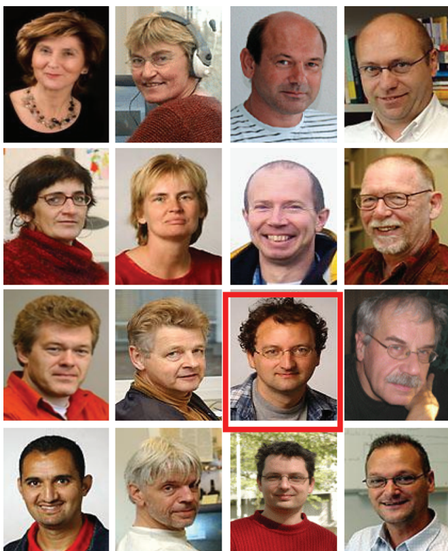
Figure 1. Example of a people picture grid. The picture with the red square surrounding it is the target object of that particular trial.

Two picture grids, each containing 16 pictures, were used by each director. For each picture grid used by the director, an alternative grid was constructed for the matcher, containing the same items as on the director's picture grid, but for the matcher, the items were numbered and presented in a different order (for example grids, see Figures 1 and 2). The picture grids showed either pictures of people or of furniture items. The two different domains (people and furniture) were used since previous studies on referring expressions had shown them to be efficient domains for making people produce referring expressions (Koolen, Gatt, Goudbeek & Kraemer 2011; Van Deemter, Gatt, van der Sluis & Power 2012; Van der Sluis & Kraemer 2007). The items of the furniture picture grid were the same as those used in the TUNA and D-TUNA corpus (Koolen et al. 2011; Van Deemter et al. 2012); the items of the people picture grid were inspired by the items from the people domain in these same corpora.