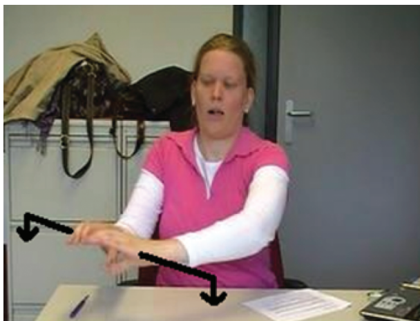
SOFA, THREE SEATS, ASKEW, BIG, TO-THE-RIGHT, TO-THE-SIDE

Figure 5. Still and gloss of initial description of a sofa, lasting 48 seconds. The NGT sign depicted in the still is SOFA, with a fairly large extension and well-defined edges (as indicated by the arrows).