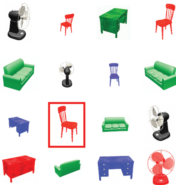
Figure 2. Example of a furniture picture grid. The object with the red square surrounding it is the target object of that particular trial.