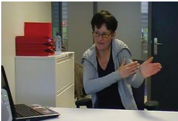
Figure 3. Camera view of the director, camera is positioned behind the matcher.

The director and the matcher faced one another across a table. A camera was positioned behind the matcher filming the upper body and hands of the director (see Figure 3 for an example).