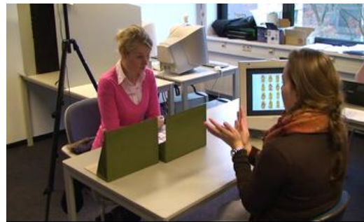
Figure 3. Setup of the experiment, matcher sits on the left and director sits on the right.

The experiment was performed in a lab, where the director and the matcher were seated at a table opposite each other (see Figure 3 for the setup).