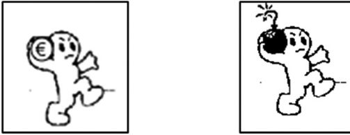
Figure 1. Virtual Cyberball players were shown to be throwing either a ball (left) or a bomb (right).

throws). In the ostracized conditions the computer players were programmed to throw the bomb/ball twice at the beginning of the game to the participant, and then only to each other for the remainder of the game.