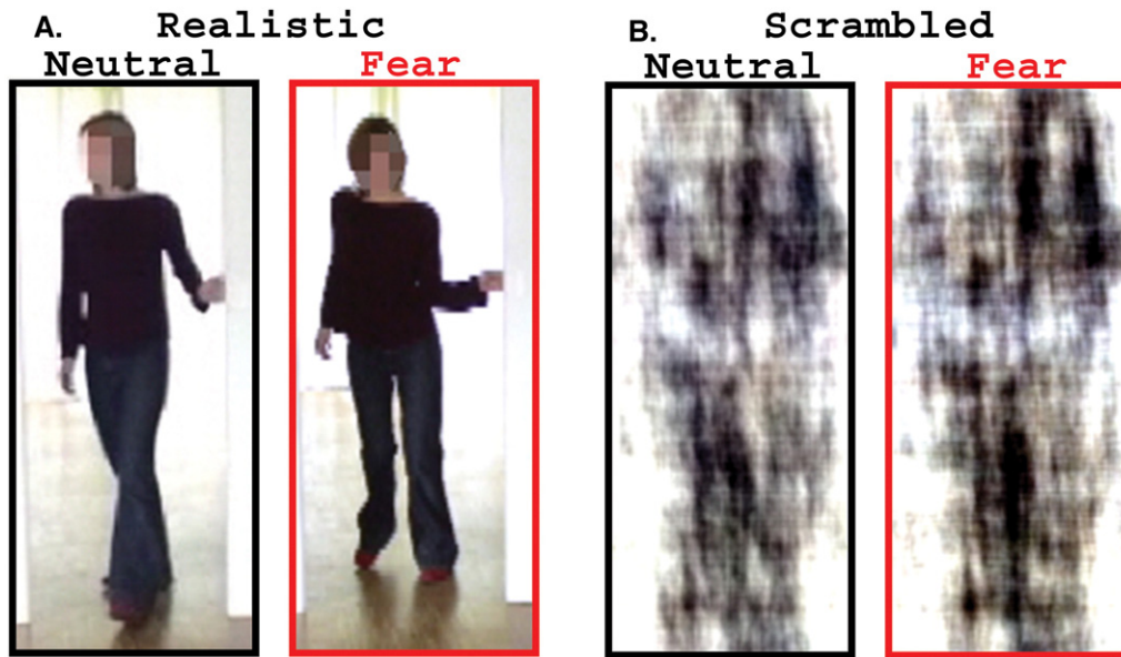
Fig. 1 – Stimulus examples of all four conditions. (A) Realistic: Neutral and Fear, (B) Scrambled (Fourier phase-randomized low-level controls): Neutral and Fear.

opening and configuration and visibility of body parts. In addition we tested whether the low-level stimulus properties of the images would induce condition-related differences in P1 amplitude or latency. To this end we measured ERPs to phase-scrambled versions of the original images, which contain the same spatial frequencies, luminance and contrast as their originals (Fig. 1B).