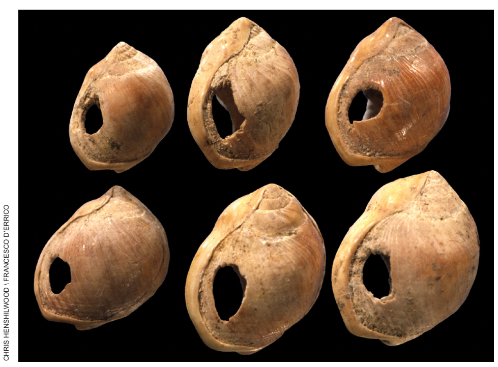
Fig. 1. Beads made from Nassarius shells, 75,000 years old, found at Blombos Cave near Cape Town, South Africa. To some archaeologists such finds suggest that mind and syntactical language of the modern type may have taken shape at least 30,000 years earlier than generally thought, and not in Europe but in South Africa. The largest bead is approximately 1 cm long.

Archaeologists also disagreed on how to interpret the archaeological record. One paper presented a model that explained some of the differences between the Neanderthal record and modern humans in terms of different energetic requirements, whereas most archaeologists would stress cognitive differences. Among the archaeologists working in South Africa, some saw this area as 'the cradle' while others argued vociferously against such a monocentric view. The conference also delivered some bad news to supporters of a 'short