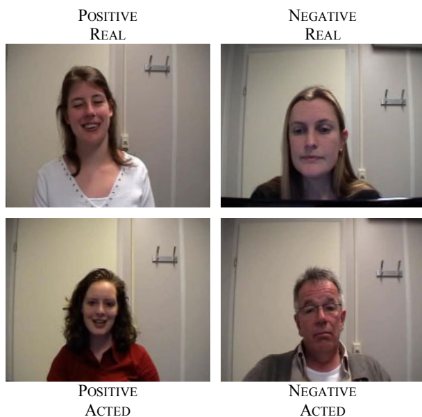
Figure 1: Representative stills of acted (top) and real emotional (bottom) expressions, with on the left hand side the positive and on the right hand side the negative versions.

NEUTRAL, NEGATIVE), two acting conditions were added. In one of these, participants were shown negative sentences and were asked to utter these as if they were in a positive emotion (ACT POSITIVE); in the other, positive sentences were shown and participants were instructed to utter these in a negative way (ACT NEGATIVE). The sentences showed a progression, from neutral (“Today is neither better nor worse than any other day”) to increasingly more emotional sentences (“God I feel great!” and “I want to go to sleep and never wake up.” for the positive and negative sets, respectively), to allow for a gradual build-up of the intended emotional state.