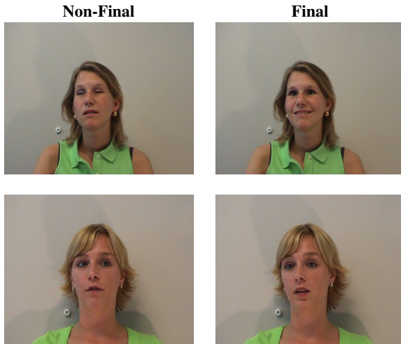
Figure 1: The speakers MP and MS while uttering a non-final and a final word.

fragment originated (i.e. final or not final).