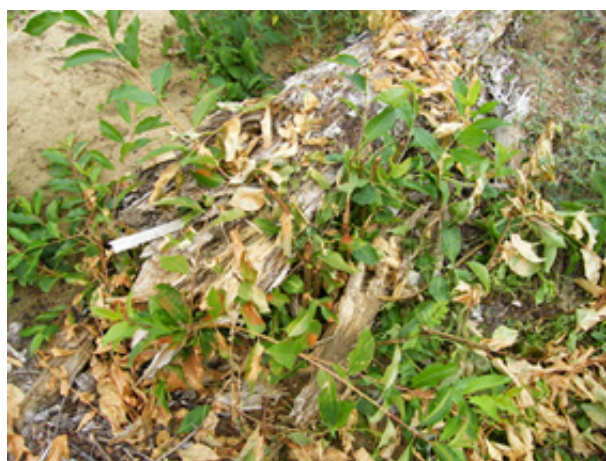
Figure 3. One efficient and one non efficient results in the scion of the treatments