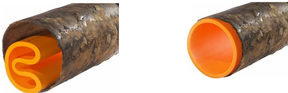
Fig. 2. Trenchless Technology - Relining Method (Company Wavin Osma Ltd).