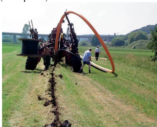
Fig. 3. Trenchless Technology – Plow method (ASB portál).

Other trenchless technology is the method of plowing. It is a method of laying pipe designed especially for long conduit engineering network running across unpaved surfaces. The method is implemented using a plow device, consisting of a tractor and plow who piping or wiring pulled into the blade grooves formed. Leadership is thus stored in aligned trench with a maximum depth of 2 m. (ASB portál).