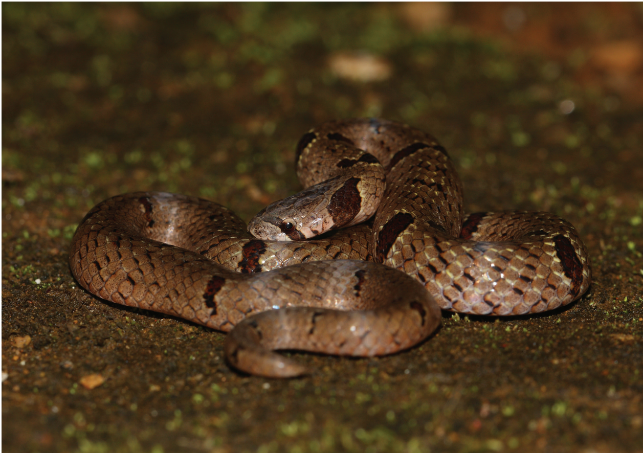
Figure 1. A live male of Oligodon sublineatus (not collected) at Sinharaja Forest Reserve, Sri Lanka.