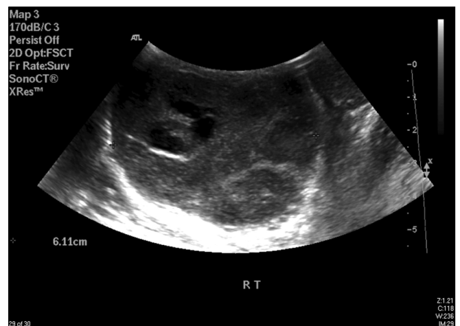
FIG. 1. Gray-scale ultrasound scan demonstrating a large cystic mass in the right testis.

Clinical examination revealed a nontender enlarged right testis. The tumor markers alpha-fetoprotein ( \alpha -FP) and beta human chorionic gonadotropin ( \beta -HCG) were negative. An ultrasound scan of the scrotum revealed a 7-cm hypoechoic, hypervascular and cystic mass replacing the right