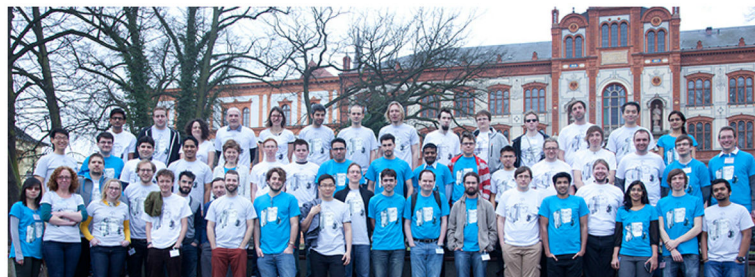
The 2015 Whole-Cell Modeling Summer School in Rostock included the 54 participants listed in Table SI.

Whole-cell modeling; Systems biology; Computational biology; Simulation; Standards; Education