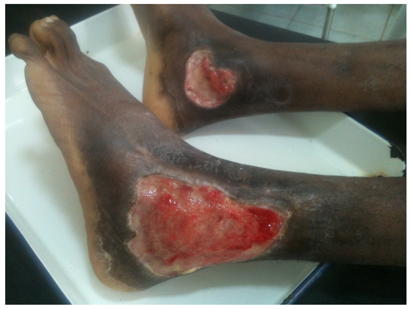
Fig 2. Image illustrating the severity of lesions in Buruli ulcer-HIV coinfected individuals; extensive bilateral ankle ulcers.