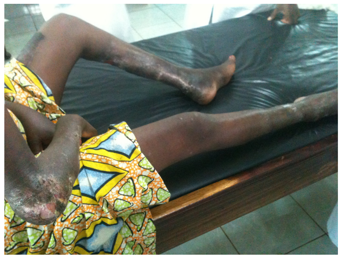
Fig 3. Image illustrating the severity of lesions in Buruli ulcer-HIV coinfected individuals; a woman with ulcers on her right elbow and both ankles.

diameter) [8]. Hence, in the absence of CD4 cell counts, assessing the BU WHO category of disease could help target the patients with the highest likelihood of significant immune suppression and need for ART.