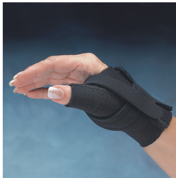
Figure 2 Comfort Cool Thumb CMC Restriction Splint.

While favourable results have been observed with different types of splints, prefabricated types are preferred over the custom-made version by most patients. 13 Moreover, different ways of using the splint have been studied. A systematic review of design and effects of splints identified two trials with low risk of bias in which best results were achieved with the use of splints during daily activities. 14 28 A prefabricated neoprene splint (Comfort Cool Thumb CMC Restriction Splint) will be used in this study. This splint is readily commercially available and does not require any customisation, facilitating potential dissemination post study, generalisability of our findings and application in routine clinical practice. The splint incorporates the base of the thumb and wrist and participants will receive recommendation to use it during activities of daily living (minimum of 4 hours/day) for 6 weeks (figure 2). The splint will be removed during rest, sleep, exercises and bathing.