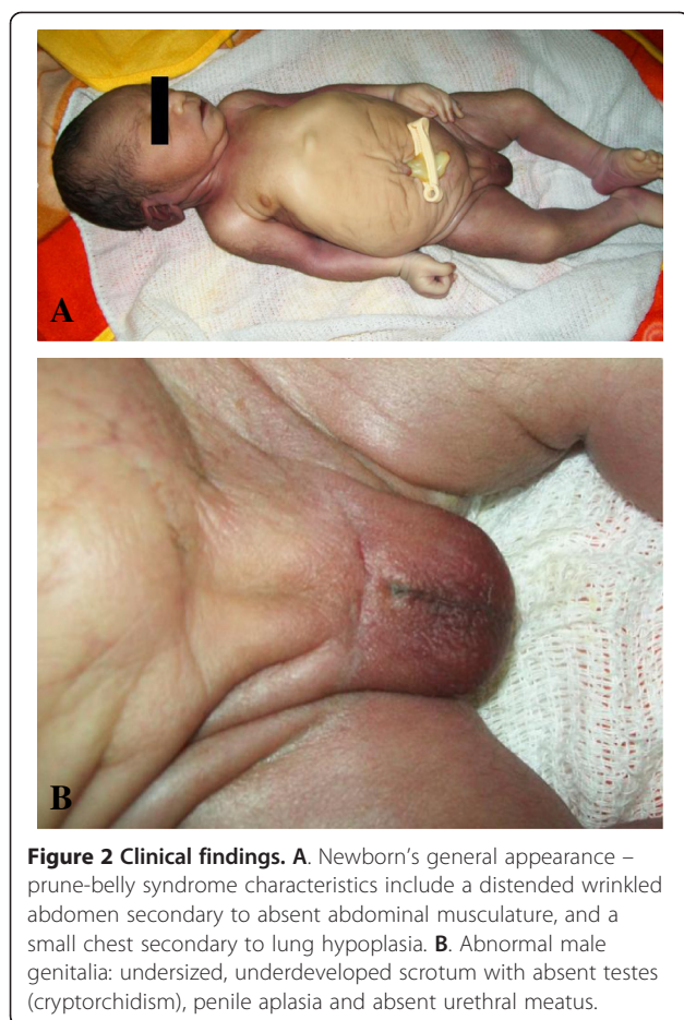
Figure 2 Clinical findings. A. Newborn's general appearance – prune-belly syndrome characteristics include a distended wrinkled abdomen secondary to absent abdominal musculature, and a small chest secondary to lung hypoplasia. B. Abnormal male genitalia: undersized, underdeveloped scrotum with absent testes (cryptorchidism), penile aplasia and absent urethral meatus.

and its onset in early fetal development, as well as the short interval between drug administration and detection by ultrasound, a study drug-linked congenital abnormality was excluded. Clinical findings and images were discussed with an external consultant neonatologist (SR) who supported a diagnosis of PBS. The parents subsequently received further counseling from both hospital and study doctors, and the mother was discharged the following day.