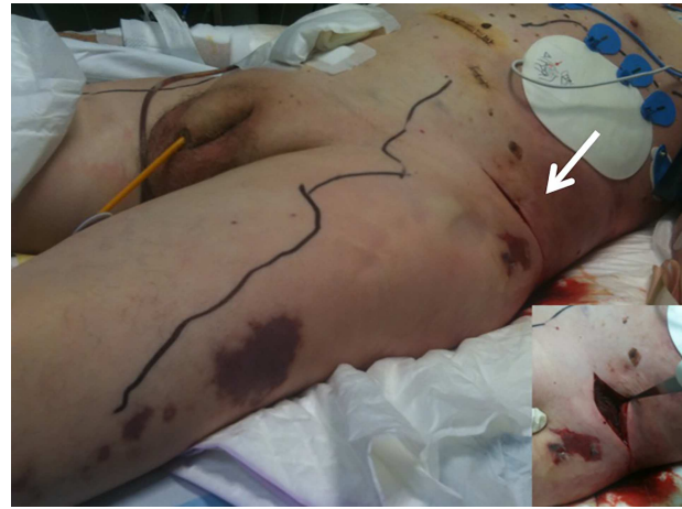
Figure 3: Case 2. Image showing the extension of the fasciitis along the abdomen and legs. Many incisions were made over the patient's abdominal wall, revealing extensive necrotic tissue (arrow).

Second case: a 77 year-old man with hepatitis C virus infection was admitted for an scheduled left hemicolectomy in the setting of colon cancer at the splenic flexure. On postoperative day 4 after the surgery, skin lesions appeared in both flanks and he was diagnosed with an allergic reaction. He received