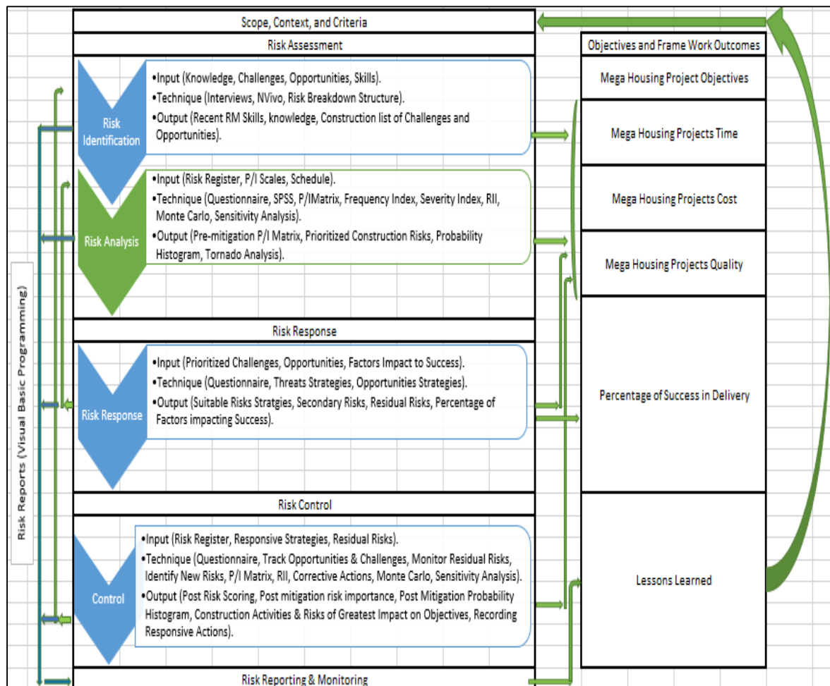
Fig. 3: Conceptual Risk Management Framework (CRMF)