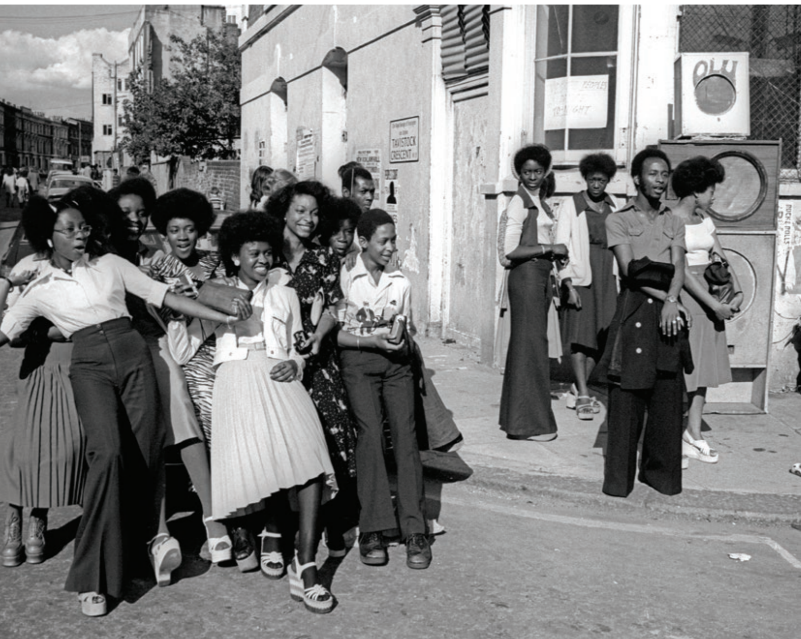
Below: Group of girls grooving on a corner at Notting Hill Carnival, London, 1975

CHRIS MULLARD, 2003 CITED IN MANN WEAVER DREW 2003: 55