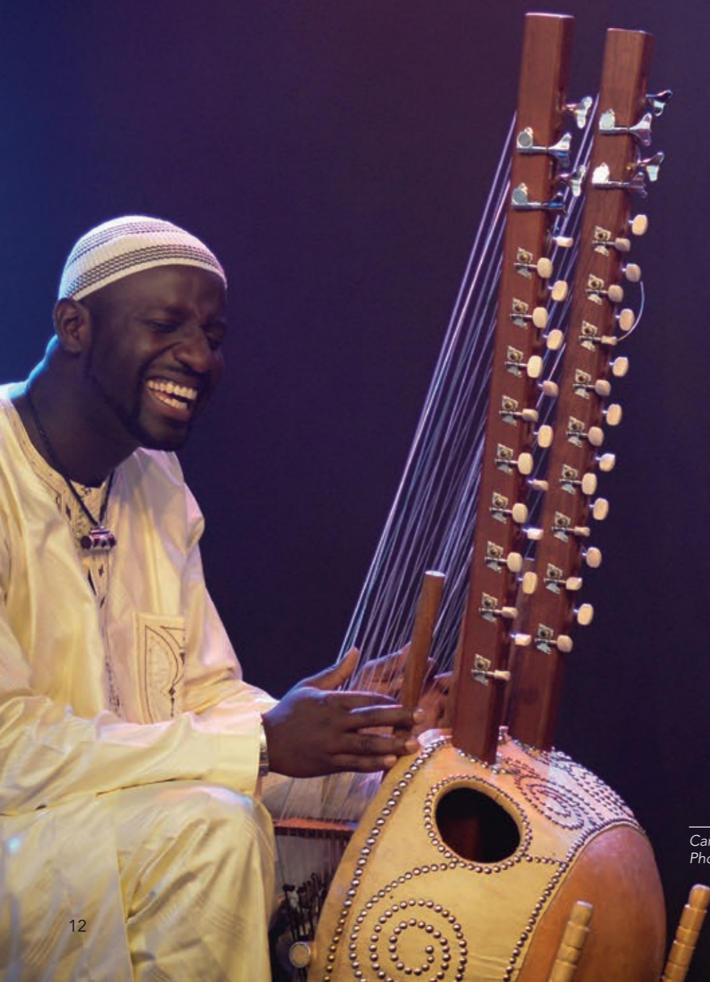
Cambridge Folk Festival 2014

CHAMBER MUSIC FESTIVAL-GOER, CITED IN PITTS 2008: 230