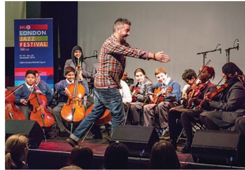
Left: Learning at EFG London Jazz Festival

Above: Cheltenham Jazz Festival