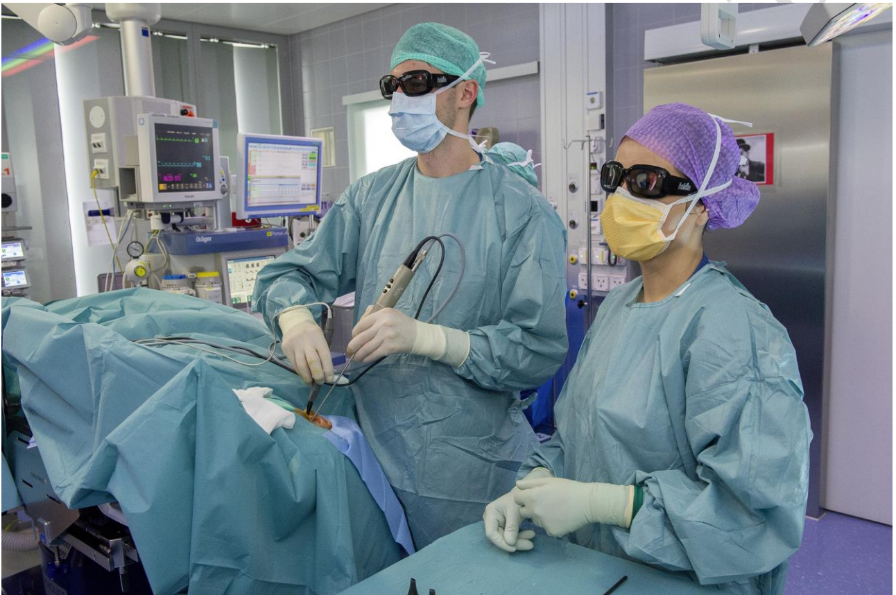
Fig. 2: Operating room during 3D endoscopic ear surgery. The 3D monitor is located in front of the surgeons, about 2 meters far from the surgical table. The upper margin of the screen is aligned with the surgeon's eyes. Additional screens provide 2D view.

Fig. 1: Surgical setting for 3D endoscopic ear surgery on the right side. The surgeon holds the videoscope in the non-dominating hand and uses the surgical instruments with the opposite, as in conventional 2D surgery. Note that the videoscope is not wrapped in a sterile bag. The scrub nurse is alongside the surgeon, looking at the monitor in a straight direction as him. Both are wearing polarizing glasses for 3D view.