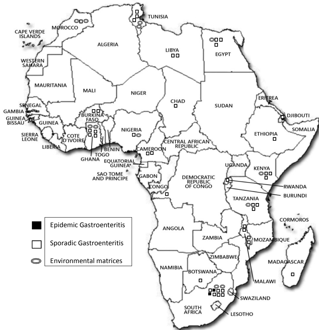
Figure 1: Distribution of selected studies for Human NoV in Africa. 55 selected studies were from 19 countries including: South Africa, Botswana, Malawi, Madagascar, Rwanda, Tanzania, Kenya, Ethiopia, Djibouti, Chad, Democratic Republic of Congo, Cameroon, Egypt, Morocco, Tunisia, Libya, Ghana, Nigeria and Burkina Faso. (Map of Africa obtained from www.kids.mongabay.com/elementary/Africa.html ).