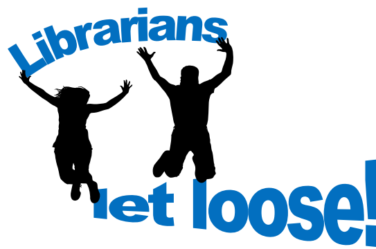
Fig. 1 Logo used to brand the UEA roving programme

Looking at the work Huddersfield had done on their roving librarian concept 4 we realised we needed a visual brand for our programme to make it clear and memorable to students and to catch their attention. 'Librarians Let Loose!' was born from the desire to keep the word librarian (as we felt this indicated who were most clearly) but also inject a sense of fun and emphasise the fact that the library service was not confined to just one building.