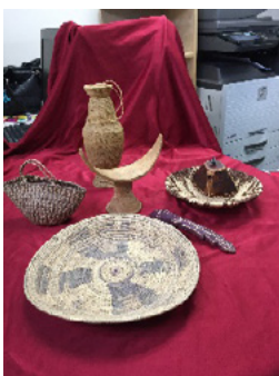
FIGURE 6. Cultural artefacts from Somalia

I like to help the teachers when I come here. And I bring in some cultural things like drum[s], like camel picture. I like to share [with] teachers and children, our culture, my culture. That’s why I bring that items ... And I help them [the centre children]. And I teach some of our culture. Yes, explain it. Even [for] other students, not only my grandchildren. If they want, I explain it. I teach them the Somali flag, and song, and other song. I teach them. But always they like it.