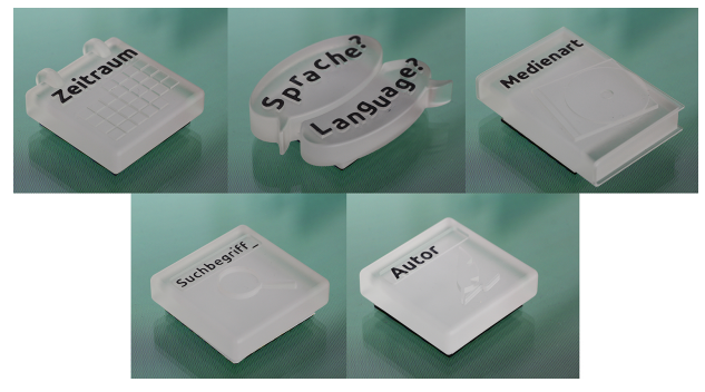
Figure 3. Filter tokens. Top row (left to right): year range, language, and media type token. Bottom row: search term and author token.

As soon as a token is placed on the display, a search query is executed and results (if there are any) appear on the vertical display (see Fig. 7). A tool tip is always visible below the token to show the number of media that match the token's criteria (see Fig. 4, left). If there are no matching media found,