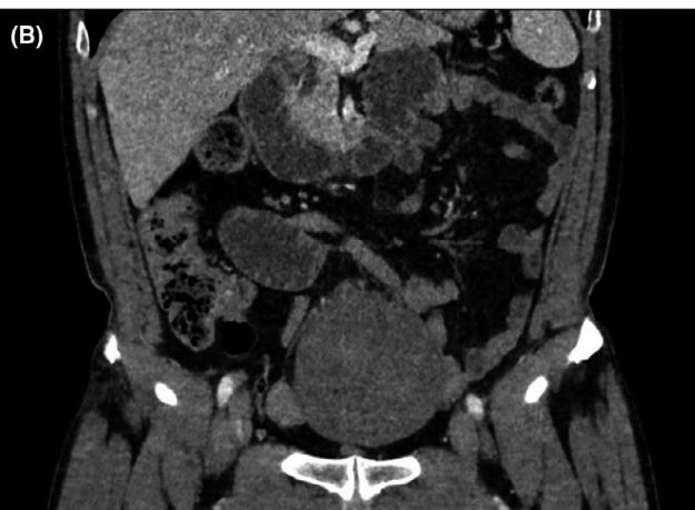
FIGURE 1 CT scan revealing a 9 \times 6 cm mass in the pelvis in contact with small bowel (A: axial; B:coronal)