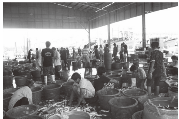
Fig. 3. Sorting area at private landing site 1.2.