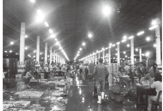
Fig. 6. Transaction site in MaeKlong fisheries cooperative.

AM. Middlemen decide the products price depending on their quality. There is an electronic auction system. Payment is in cash and credit. Products are distributed to Phuket, Samut Sakhon, Krabi, Bangkok, and Hatyai and exported to Japan and Taiwan.