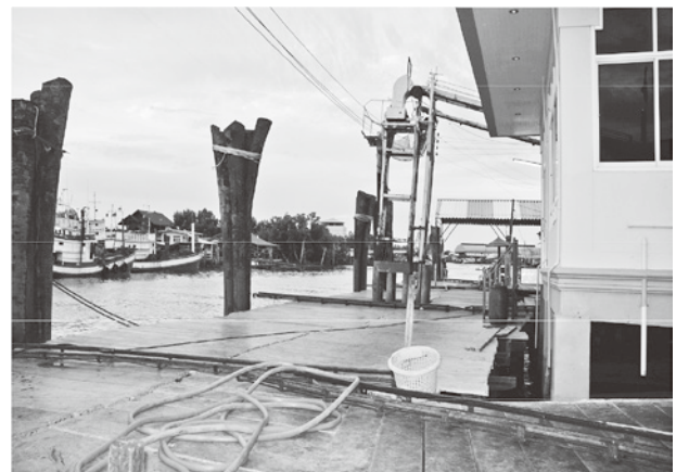
Fig. 2. Landing area at Private landing site 1.1.