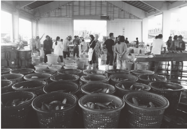
Fig. 5. Sorting area at FMO landing site in Phuket.