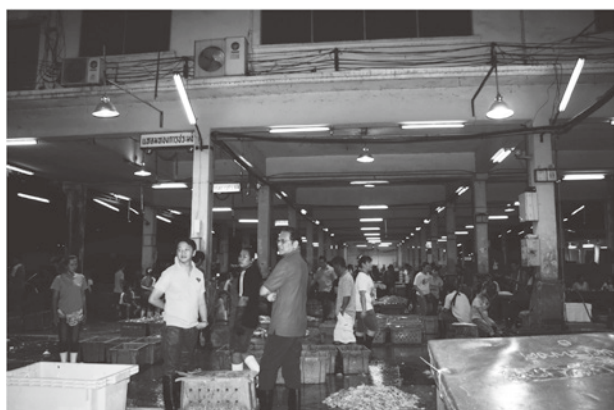
Fig. 4. Middle-wholesaler's space in FMO fish market in Bangkok.

The most common transactions are carried out in a negotiation style ; however there is an auction for some aquaculture products such as shrimp, crab, and freshwater fish. Marine products were transacted from 1 : 00 AM, and aquaculture products were from 3 : 00 AM. Payment was by cash or credit. The FMO officer checked the middleman's compa-