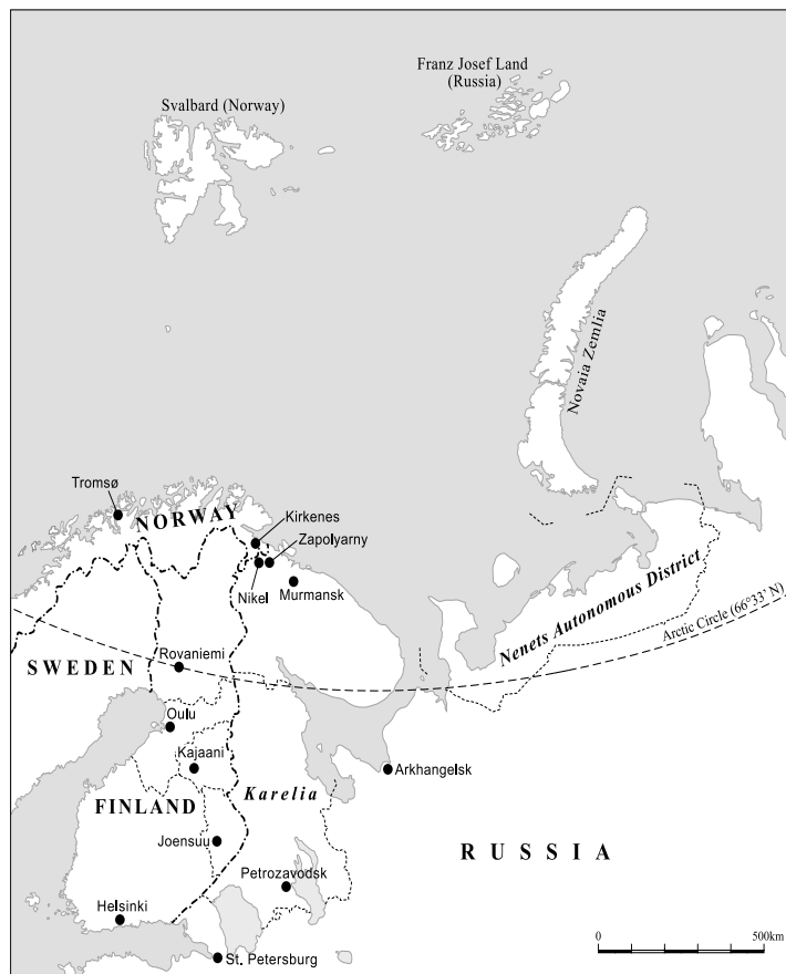
Figure 1: Russia and Nordic Countries

Despite periodic collisions with Moscow, many regions and municipalities continue to see the