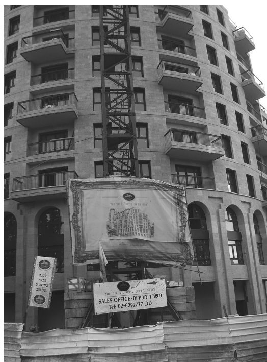
Figure 3: “Jerusalem of Gold” Housing Compound

The most significant message to potential buyers is no doubt the religious and national centrality of Jerusalem. Thus several large images of “historical Jerusalem” are presented. The first instance is an image of archaeological