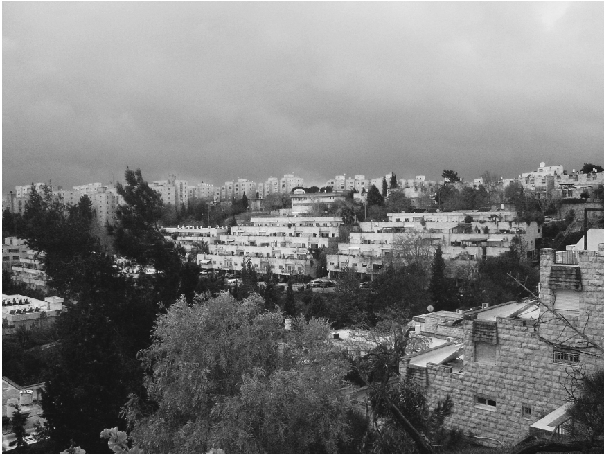
Figure 2: A general view of the French Hill neighbourhood

In more details, both geographically and symbolically the frontier location of French Hill is significant. Geographically it is surrounded by a “contested landscape” including a fraction of the Separation Wall. It watches (and indeed is watched by) the Palestinian refugee camp of Shuaafat and it marks the edge of the city as it is situated by the main road that leads to and from the Judean desert.