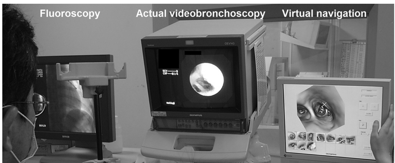
Figure 1 Virtual bronchoscopic navigation. An assistant physician controls virtual bronchoscopic images of the path leading to a peripheral lesion and a bronchoscopist inserts an endoscope as instructed.

Bronchoscopic insertion was assisted using the VBN system in the VBNA group. The bronchoscope was introduced into the bronchus of the NVBNA group without VBN support and with reference only to CT axial images. Lesions were visualised in both groups by inserting a 20 MHz mechanical radial-type EBUS probe (external diameter, 1.4 mm; UM-S20-17S; Olympus Medical Systems) with a guide sheath (K-201; Olympus Medical