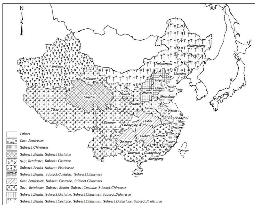
Fig. 1. Distribution of section and subsection of birch in China (after Jiang 1990).

From a horizontal view, in China, birches distribute continuously from the Hengduan Mountains to Qingzang Altiplano, especially Betula alnoides , and