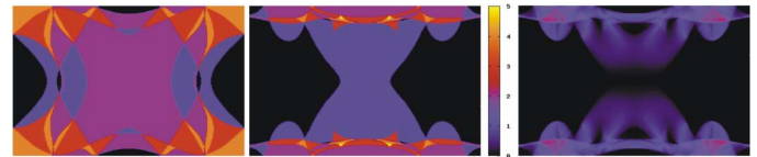
Fig. 2. Conductance of a two-cluster device (inset) as a function of the orientation of the magnetizations.