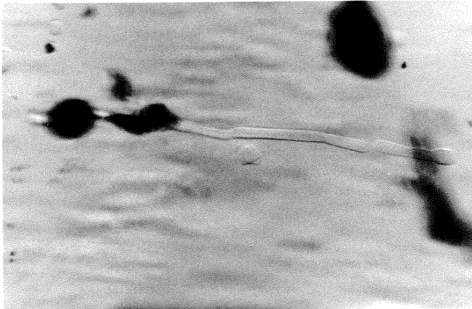
Figure 2: Elongated air hydrate crystal 1327-m deep in the Summit ice core. The width of the picture is 2.6 mm.

The cloudy band is a milky-colored zone with clear ice above and below, and easily seen by the unaided eye; the prime source for this light scattering is a high density of small bubbles (micro-bubbles). These micro-bubbles are sometimes distributed in a line or plane (Fig. 4). Their occurrence suggests that air molecules might diffuse into a triple junction of one or more sub-boundaries and then form micro-bubbles. The role of grain boundaries in the bubble to hydrate transformation and in the relaxation of deep cores after recovery are not known in detail, but are certainly important. X-ray diffraction topography studies on ice core samples revealed highly strained regions around cleavage cracks [Shoji and Higashi, 1978]. Bubble growth (relaxation after core recovery) and shrinkage (in situ in the ice sheet) occur