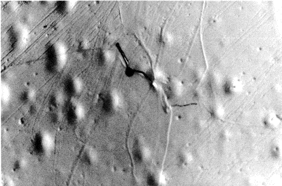
Figure 3: Elongated air bubble 1465-m deep in the Summit ice core. The width of the picture is 2.6 mm.