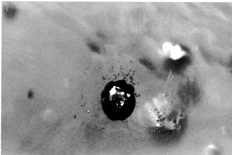
Figure 5: Micro-bubbles surrounding a larger bubble that has grain boundary grooves on its surface. The sample is prepared from a section 1327-m deep in the Summit core. The width of the picture is 2.6 mm.