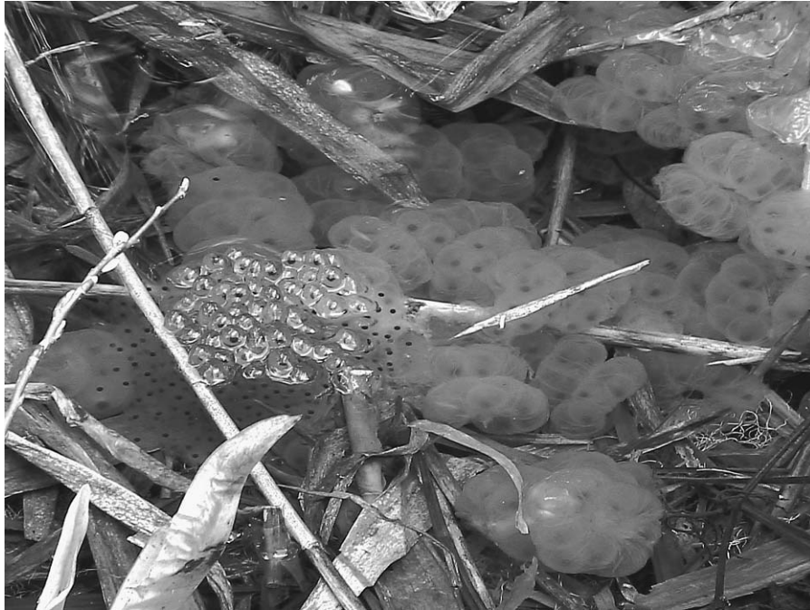
PLATE 1. Spawned egg sacs of Hynobius retardatus salamanders and an egg mass of the frog Rana pirica in a small pond on Hokkaido Island, Japan. After hatching, both amphibian larvae form intimate predator–prey relationships.

exposed to the predaceous H. retardatus phenotype exhibit bulgier phenotypes than those exposed to the non-predaceous H. retardatus phenotype (Kishida et al. 2006). The reciprocal plasticity evident in this two species may reflect a finely tuned coevolutionary arms race.