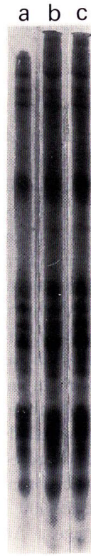
Fig. 3. Electrophoretograms of acid-insoluble proteins at three different stages of development. Acid-insoluble proteins were obtained from three different stages and electrophoresed on SDS-polyacrylamide gels. a, vegetative stage; b, aggregation stage; c, culmination stage.

ribosomal proteins which surely have an important role in the transcriptional and translational machinery. The protein bands of the acid-soluble fraction were referred to by the number preceded by the letter "AS". As shown in Fig. 2, the staining intensities of the protein bands AS2 and AS3 in the acid-soluble fraction were increased at the pseudoplasmodial stage, whereas that of AS5 was decreased. In addition, the molecular weights of AS2, AS3 and AS5 were the same as those of W16, W18 and W20, respectively.