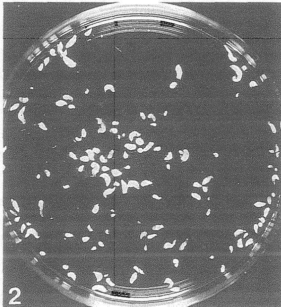
Figures 1 and 2. Materials of Dactylorhiza aristata used for isolations. 1: The underground organs of an adult plant at anthesis. T, tapering extension of a palmate root-stem tuberoid; M, main part of a palmate root-stem tuberoid; Arrow = root. 2: Protocorms resulting from naturally germinated seeds collected from a soil which were sampled with an adult plant. In a 9 cm Petri dish.