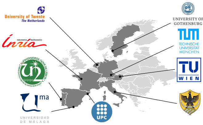
Fig. 1. Participant countries.

expressed by the community were the triggers for the study described in this paper.