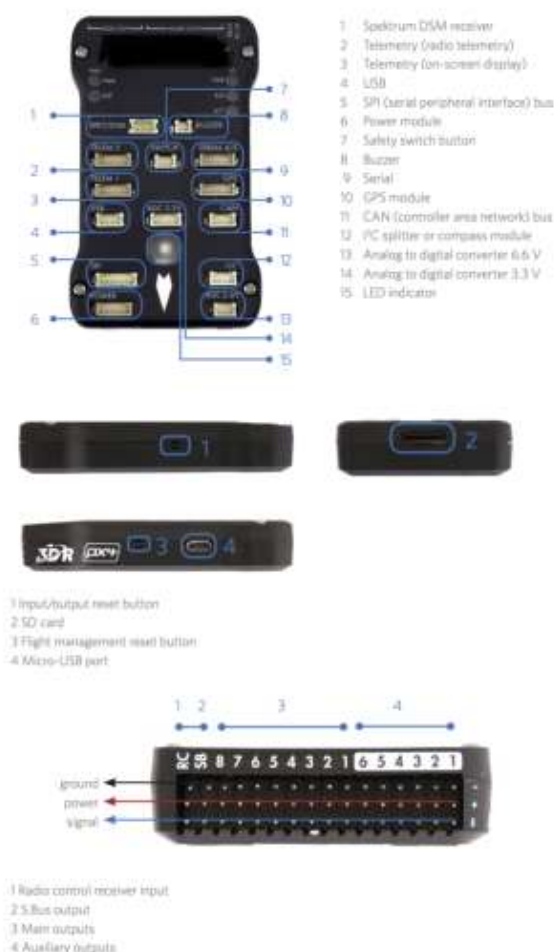
Fig.1. Flight control's connections.