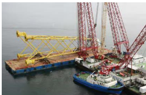
Fig. 1. Jacket structure on a barge.

Current and future North Sea offshore wind developments need complex supply chains, which involve countries out from the North Sea, like Spain, Portugal or the Atlantic coast of France. However, the distance and the rough met-ocean conditions of the North Atlantic areas introduce some uncertainties over the suppliers from those countries.