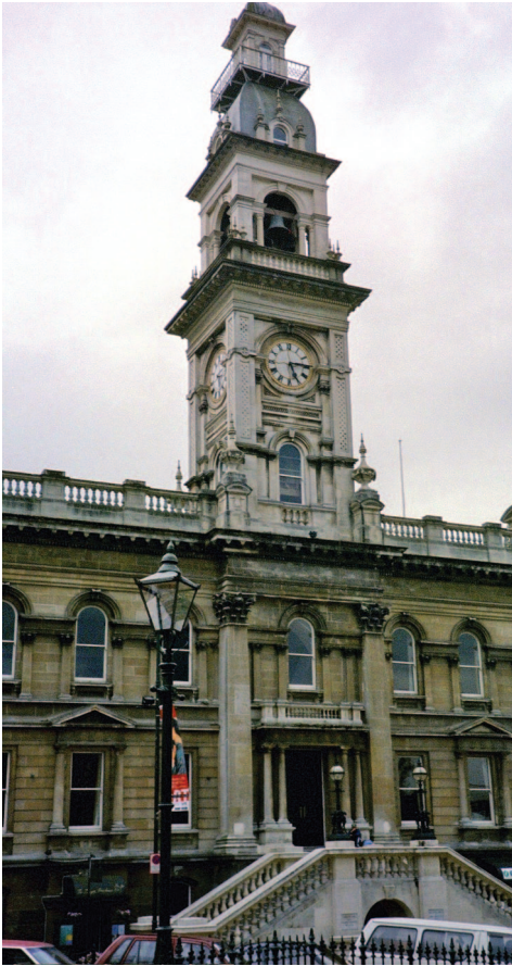
Figure 3. Town Hall at the Octagon in Dunedin, Photo contributed by DLiebisch on de.wikipedia.

the balcony by reading the transcribed text of his measuring from the previous ninety minutes. The donut time and data. Chewed but flowing.