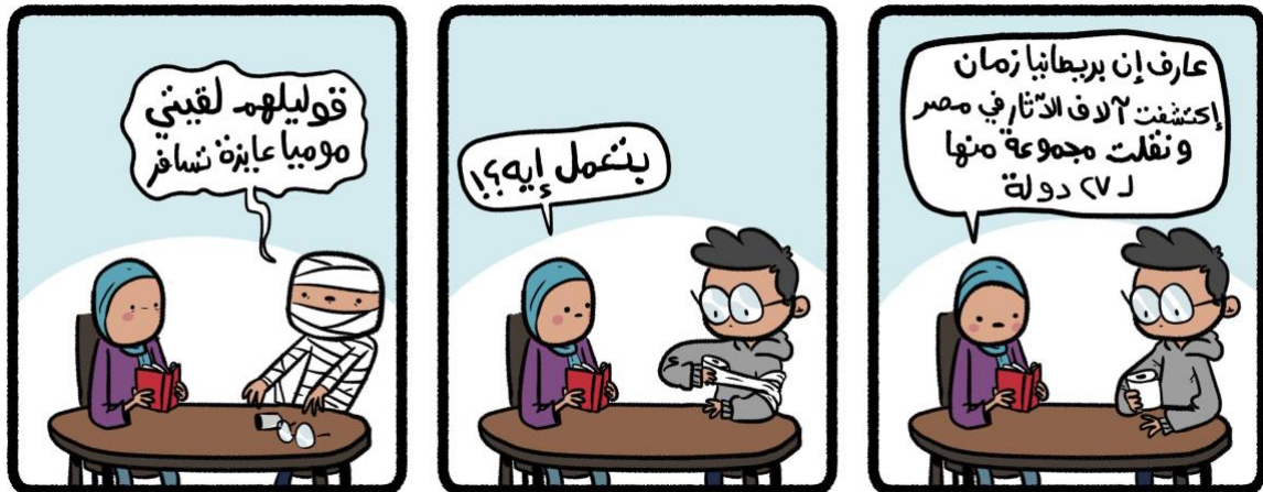
Figure 1: Comic number 1 by Nasser Junior released in February 2020 commenting on the ease of international antiquities movement versus the difficulty of international movement for Egyptians.

The first comic strip introduced the project (Figure 1) and featured avatars of Abd el Gawad and Nasser Junior in conversation. In this way the co-creative nature of the project was clearly visible and their dialogues around the EDH subject matter foregrounded. The three-panel story demonstrated the multiple levels at which the comic operated between different