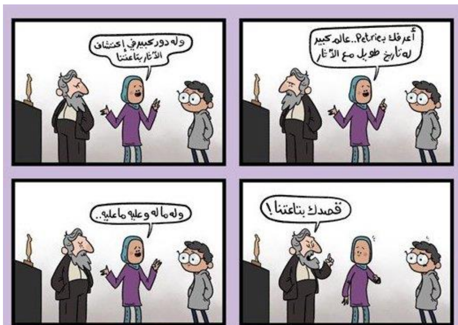
Figure 4: Comic 6 by Nasser Junior addressing UCL’s eugenic legacy and the position of Flinders Petrie in histories of archaeology.