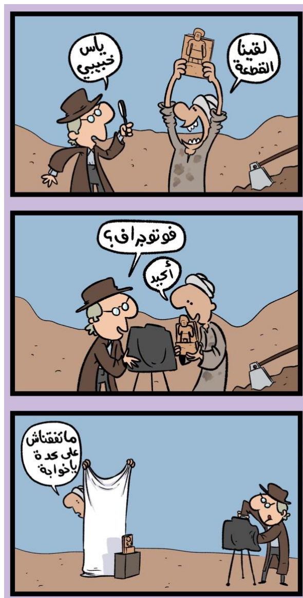
Figure 5: Comic 8 by Nasser Junior addressing excision of Egyptian workforce from narratives of archaeological fieldwork.

numerous discussions on what constituted archaeological labour and the ongoing prejudices that affect fieldwork today. Notable too was the extent of self-criticism the comic evoked. Many Egyptian archaeologists confessed that the colonial practice of dismissing the knowledge and work of the Egyptian digging hands persists today among Egyptian-led archaeological projects: “The same exists today the Egyptian workman does all the hard labour of excavating and making discoveries and in the end the Egyptian director who has done nothing claims all the work as his own”. On the other hand, many Western archaeologists used the comic as a starting point for an open, online discussion about the need to reconsider and reevaluate how Egyptian knowledge and involvement in archaeological knowledge production should be accredited and acknowledged. This reveals how light-hearted media and manner of engagement could, if used effectively, promote policy and practice change both in the field and the museum. It further signifies how public dissemination of knowledge and subsequent discussion may be as important as academic publication.