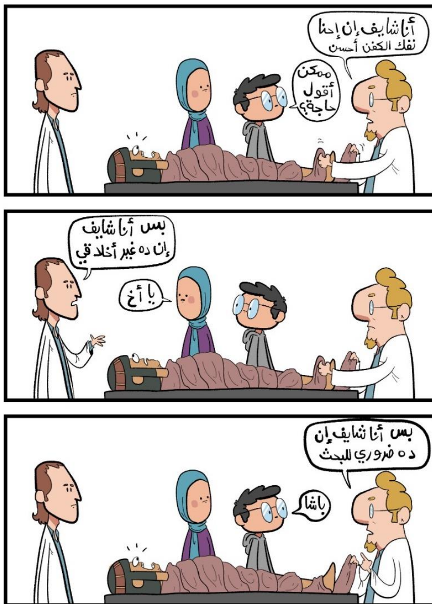
Figure 3: Comic 3 by Nasser Junior responding to UK debates on the role of human remains in museums and based on collection history of remains in Horniman Museum and Gardens, London.

were evident too, with one individual commenting that “Egyptians gave up their rights when they gave up their heritage” while another commented that “since authorities allowed human remains to leave the country past and present, we have no right to object”. Others believed that ancient and modern Egyptians are disconnected, as one user pointed out “They are not our ancestors. We have inherited them, and we haven’t protected them, nor did we research or educate ourselves about them”. While we do not assume that these comments are representative of public views given that not writing comments is the norm on social media (Crawford, 2009) what is clear is that local viewpoints in Egypt on this topic are as diverse as might be found anywhere, reminding us not to construe simplistic, essentialist dialogues of western versus local perspectives. It is also evident, however, that whatever their opinions, Egyptians were keen to be involved in these debates.