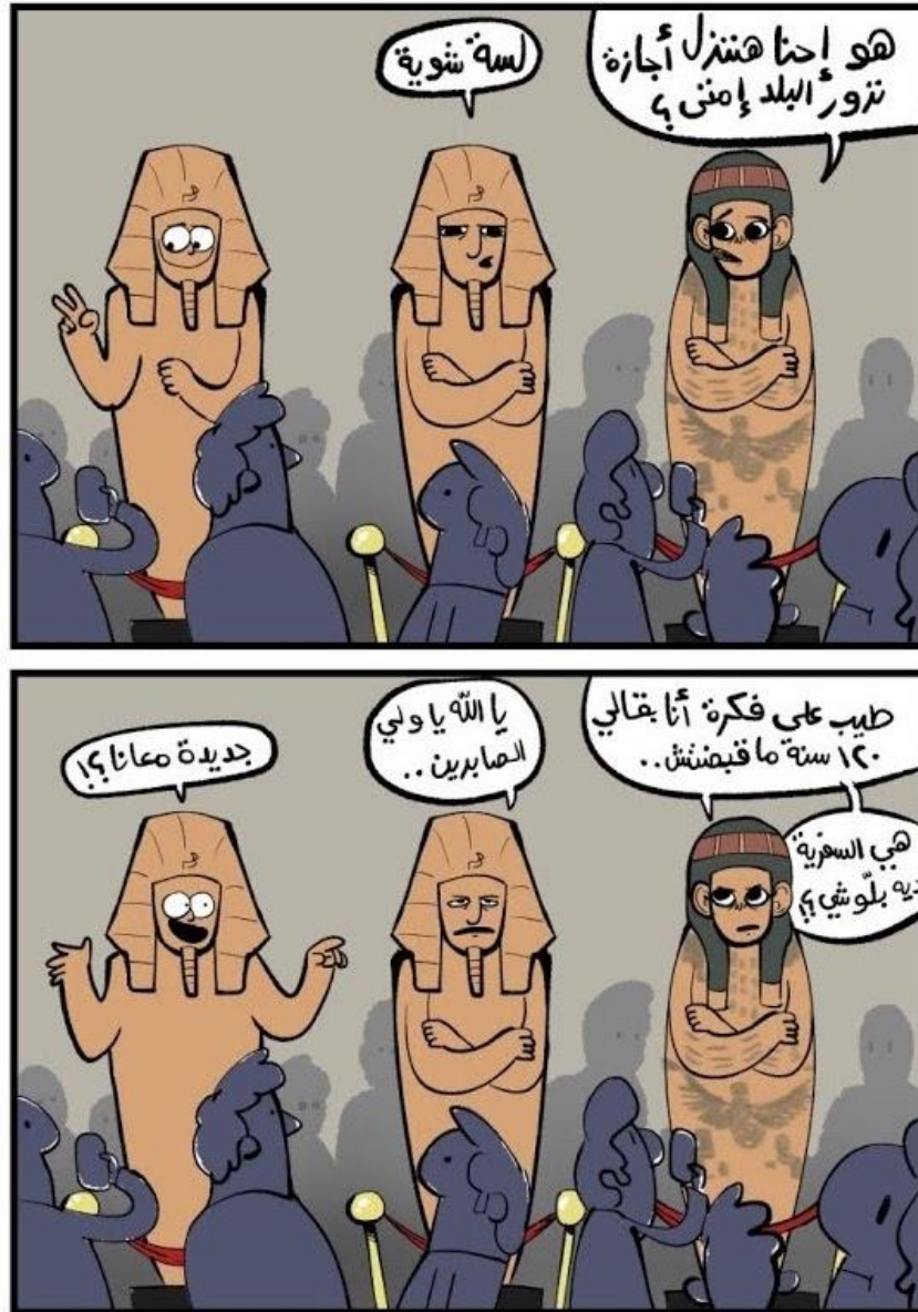
Figure 2: Comic 2 by Nasser Junior based on the collections of the Horniman Museum and Gardens, London.

The second, released on 13 March 2020, was a response to a call for a major ethical review of the treatment of Egyptian mummies in UK museums following sensationalist news stories relating to studies of dubious scientific validity (Atkinson, 2020). An 1897 unwrapping event at the Horniman museum of one of the mummified humans was the departure point. This was then framed in reference to a popular Egyptian meme denoting being ignored, which itself was based on the famous Egyptian comedy movie The Great Fava Beans of China (2004). In the comic (Figure 3) Nasser and Heba are depicted standing over a horrified looking Egyptian mummified human body, either side of which are two white male scientists debating the ethics of their approach. Nasser and Heba struggle to have their voices heard. The comic garnered extensive commentary. "Scientists should imagine themselves or any of their family in the same position as these human remains; would they want to be unwrapped and exposed to the world?" commented one Facebook user. "Unless we have their explicit consent, these humans should never be unwrapped or dug up" commented another. Feelings of inferiority