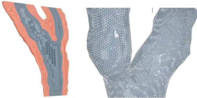
Fig. 1. Computational mesh created for a healthy case. Left: meshes of the the lumen (grey) and the vessel wall (red), composed of tetrahedral elements. Right: view of the bifurcation in the carotids.

fluid simulations are presented. In this case, the fluid is simulated as laminar, viscous, incompressible, Newtonian flow in a fixed domain solving the Navier-Stokes equations and choosing suitable initial and boundary conditions [5]. The 3D computational model is performed in Alya, the multi-physics and parallel code developed at BSC [9, 10, 11, 12, 13] and solved in parallel in the Spanish Marenostrum supercomputer.