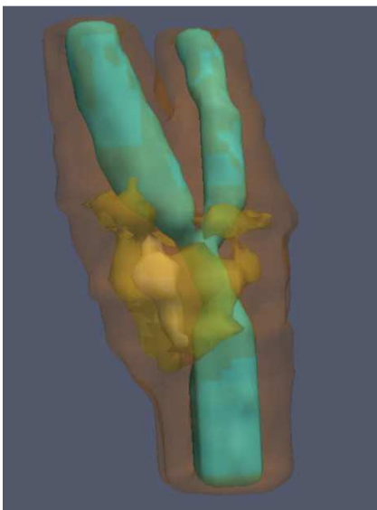
Fig. 2. Surface mesh of a pathologic case in the carotids bifurcation. Lumen (blue) and wall (brown) are represented in colors. The atherosclerotic plaque is drawn in yellow.

Fig. 2 shows a pathological carotid artery where different components have been identified. The result of the simulation is presented in Fig. 3 and it is compared to the healthy carotid artery of the same patient. In both cases, MRI data has been used to provide the geometry and boundary conditions (i.e. inflow, and outflow) for a computational fluid dynamics calculation.