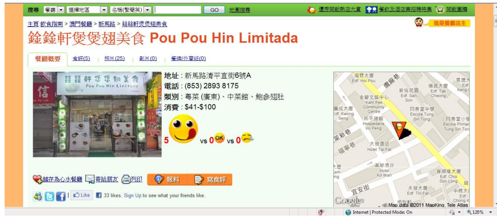
Fig. 6: Contemporary restaurant guide for Macau and Hong Kong including blog and map (openrice.com/restaurant/sr2.htm?shopid=49584, retrieved 19.9.2011)