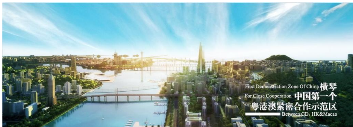
Fig. 4: Rendering of the future Shizimen CBD (right) on Hengqin and Macau in the background. Design of the CBD by HOK Asia.

Although a coordinated planning is missing, both Macau and Zhuhai can function in general complementary, with Macau specializing on gaming and luxurious hotels, as well as shops specialized in brand products, jewelry and watches; and Zhuhai covers the market of lower priced hotels as well as extensive golf resorts. In addition, Zhuhai becomes a place for second homes of people from Macau and Hong Kong, due to its lower prices and comfortable environment and it partly compensates Macau's poorest residents with cheaper goods and services (Breitung, 2007).