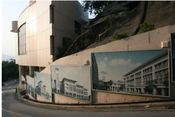
Fig. 5: Renderings of the future campus of University of Macau on Hengqin displayed on the current campus in Macau