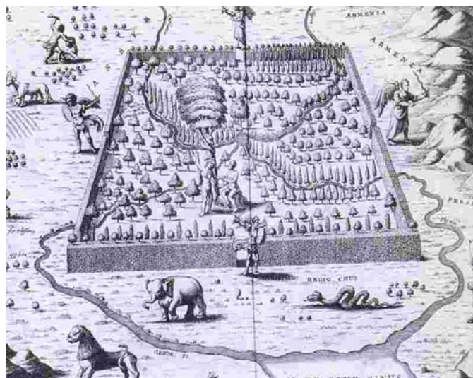
Fig. 2 Topographia paradise terrestris iuxta mentem et coniecturas auctoris , from his Arca Noe , Athanasius Kircher, c.1675. Both figures collected from: Scafi, Alessandro: Mapping Paradise .