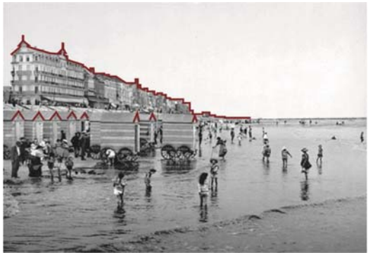
Figure 1. Bathing machines

Tourism began as an urban phenomenon. An invention that crystallizes the values and the social practices even in areas that are distant from the urban model, based on attributes established for the city: mass, contiguity and monumentality (Cooffé, 2010).