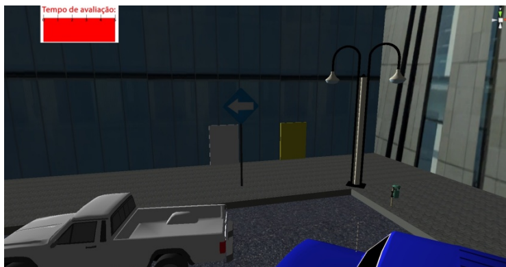
Figure 4. The doors where the patient must enter to change the level of stimulation

A pipeline of the system use is presented in Figure 5.