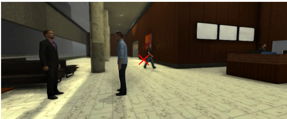
Figure 3. Extended office environment rendered in the Unity game engine

Future iterations are expected to address bugs and critical feedback once the clinical trials have been finished. Further changes are anticipated once all patients have been tested and validity and reliability analyses have been applied to cognitive task outcome measures. The system's task and data collection components can then be adapted to improve the tasks' validity and clinical value as a cognitive assessment.