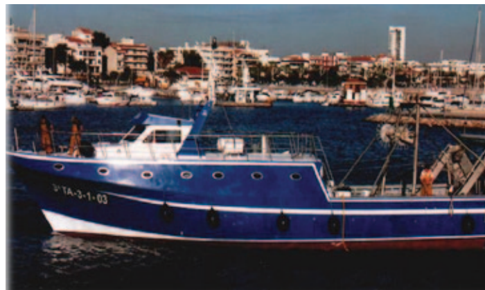
Figure 2. Monitored trawler vessel.

A remote monitoring system was developed in order to observe different parameters of fishing vessels [2] (speed, temperature, position, fuel consumption, wind speed and direction, etc.), Figure 2. This monitoring allows the fishing companies, and workers to test different fishing strategies and technologies, in order to improve the efficiency of fuel consumption.