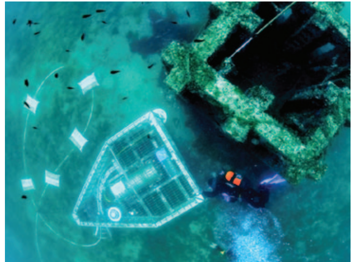
Figure 3. OBSEA observatory.